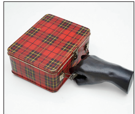
Mildred Howard, Square Meal , 2021 , cast bronze and found object.