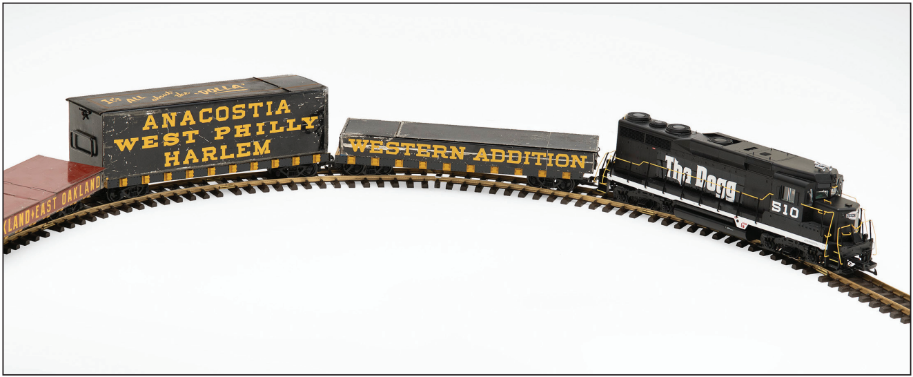
Mildred Howard, Tha Dogg , 2021 , model train with customized safety deposit boxes.

In the same way that objects can be modified to act as symbols words can sometimes be played with to evoke multiple meanings and relay messages. In the work Square Meal the bronze casting of a child's hand is clutching an old-fashioned school lunch box. Playing off the square shape of the lunchbox the artist is pointing out that this is a meal in a square container. However, when we say "square meal" we usually mean a large and healthy meal rather than one that is square in shape.