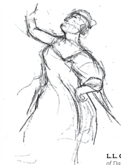
L.L. Gorian , Gesture drawing of Dancer , 2021. © L.L. Gorian.

Choose the figure you want to draw. Look for the most prominent lines and shapes. Always begin with light lines and then increase darkness as it progresses. Remember: no erasing, no details, and no shading.