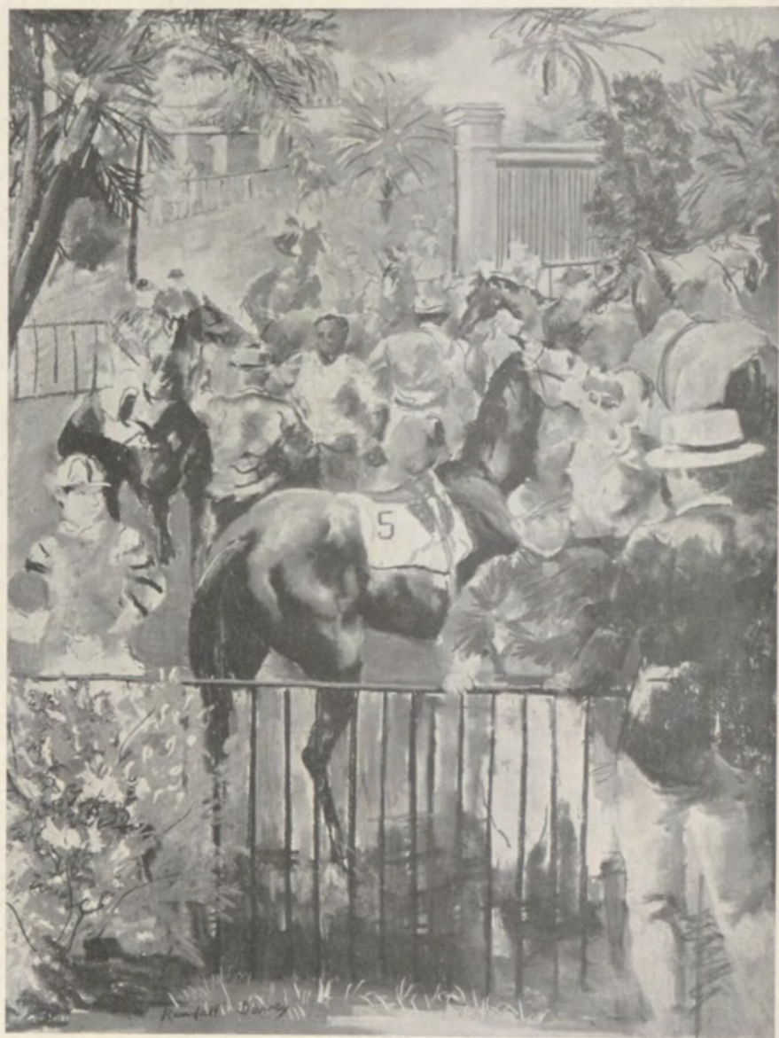
UNSADDLING Paddock— Randall Davey