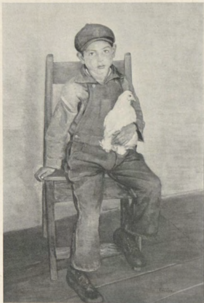
"LADY, BUY ONE CHICKEN?"—Bert Phillips