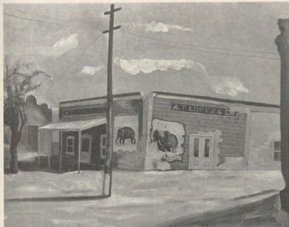
IN OLD MESILLA—Vernon Hunter